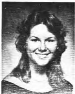
Laura Laney Center